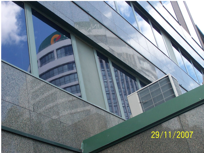
All Levels - Photo No: 97 Exterior Above & Below Window Panels - Infill Panels