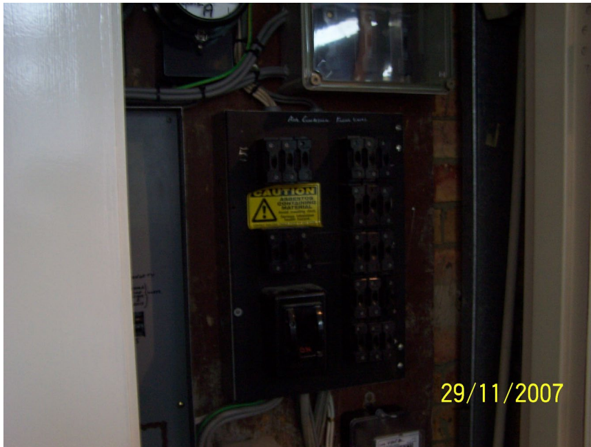
Level 3 - Photo No: 94