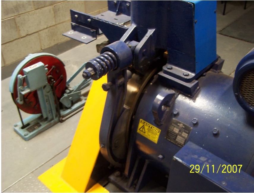
Level R - Photo No: 95