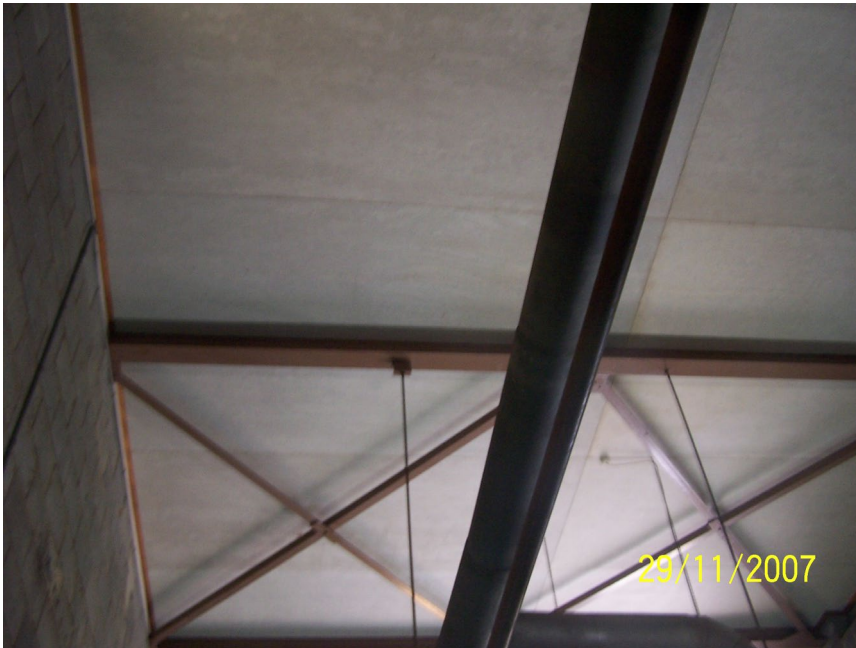
Level R - Photo No: 89