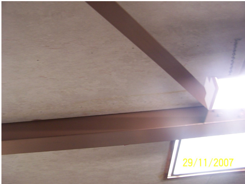
Level R - Photo No: 96