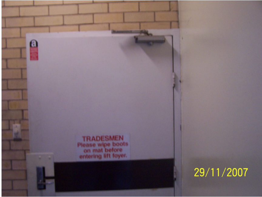
All Levels - Photo No: 87 Stairwells – Access Door