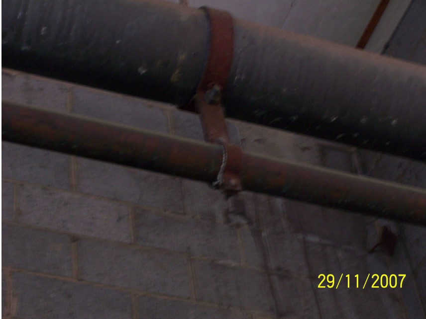
Level R - Photo No: 90